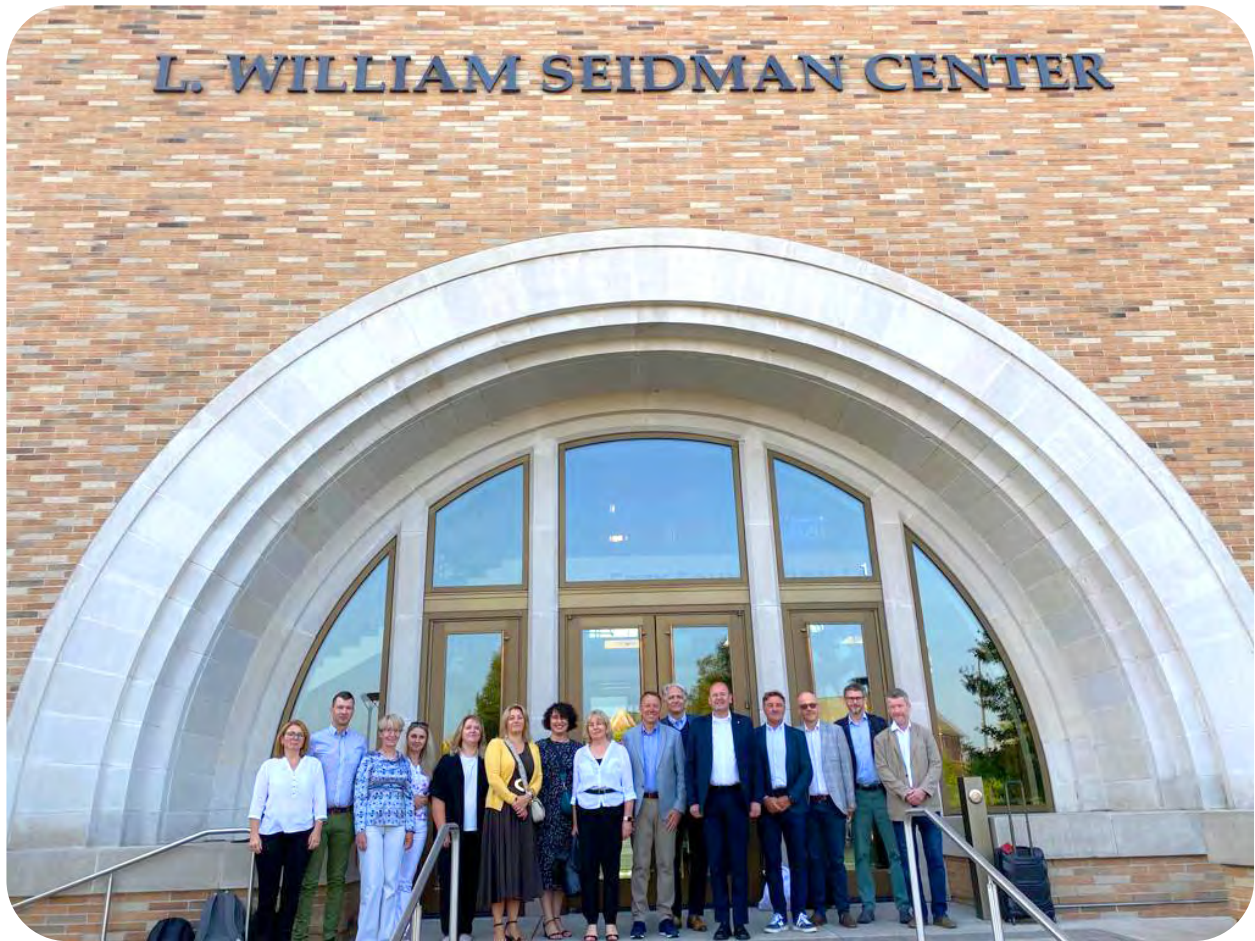
Visit of the KUE College of Management and Quality Sciences staff to GVSU, August 2023