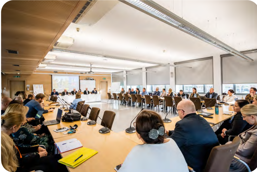
Innovate, Learn, Connect: Bridging Business and Experiential Learning workshop during the visit of the GVSU delegation at KUE, October 2023