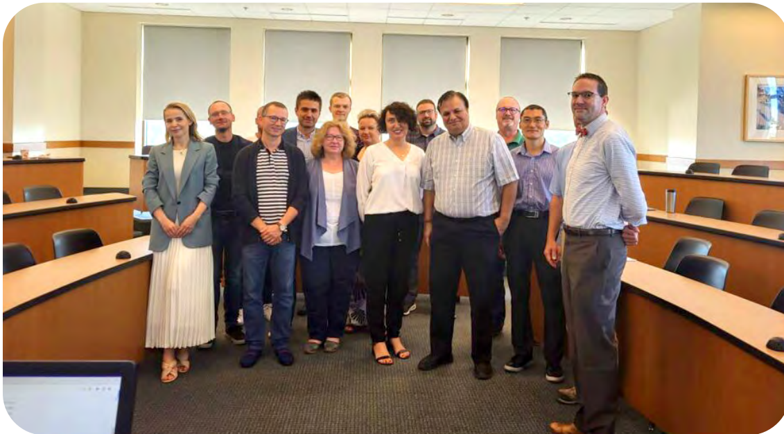
Visit of the KUE Institute of Finance staff to GVSU, September 2022

In January 2025, the inaugural meeting of the International Mentorship Program KUE–GVSU took place. Students from both universities now have the opportunity to work online with mentors across the ocean, gaining insights into each other's business environments. In May 2025, they will meet in person, opening new opportunities for the next decades of collaboration.