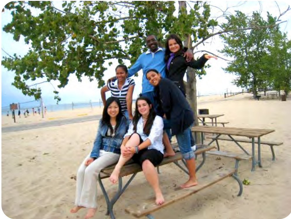
International students (including some from KUE and GVSU) during the exchange at GVSU